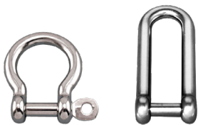
S0116-CP Series & S0138-NS Series

The Bow Shackle features a non-removable captive pin and is offered in sizes ranging from 1/4" to 15/32".